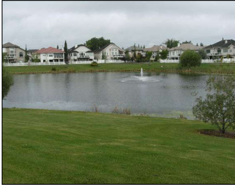
Figure18: Red Deere, AB. used Alfalfa Green to improve turf grass appearance in areas prone to flooding or water movement.