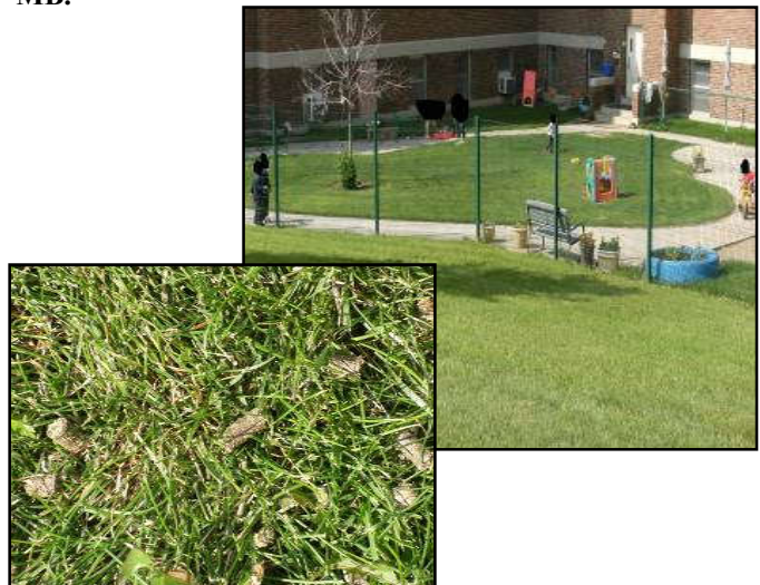
Figure 14: Saskatoon Health Region uses AG on lawns outside both Royal University Hospital and St. Paul's Hospital in Saskatoon, SK.

Western Alfalfa Milling Co. Ltd. (WAMCO)