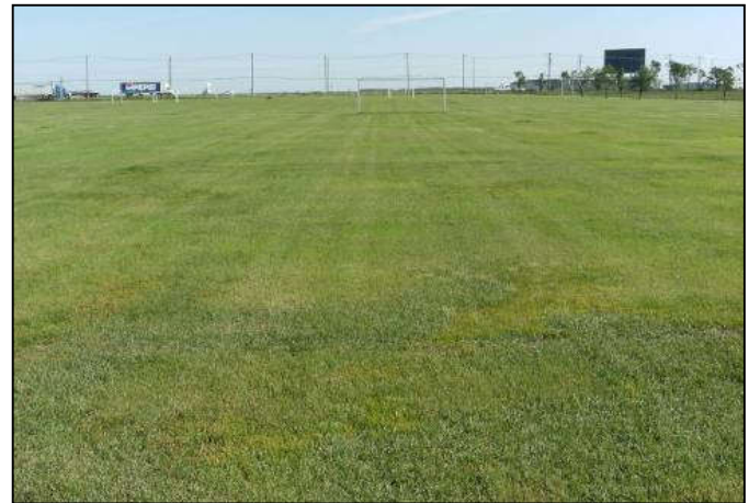
Figure 13: John Bloomberg Soccer Complex in Winnipeg, MB.