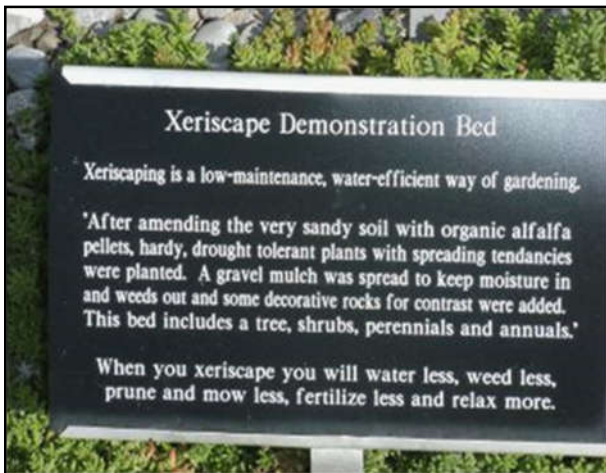
Figure 8: Xeriscaping at the Devonian Botanical Gardens at the University of Alberta.