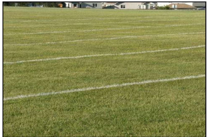
Figure 16: Football field in Stony Plain, AB.