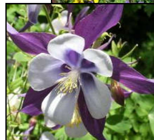
Figure 5: Blooms in Chestermere, AB. (top right) and Riding Mountain National Park (bottom left).

Western Alfalfa Milling Co. Ltd. (WAMCO)