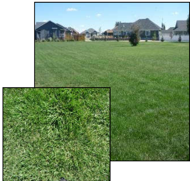
Figure 17: (Left) Anderson Park in the Town of Three Hills, AB. (Right) Soccer field in Airdrie, AB.

Western Alfalfa Milling Co. Ltd. (WAMCO)