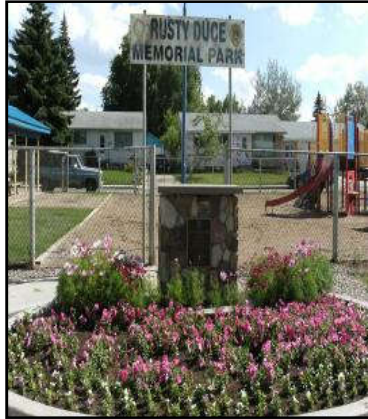
Figure 6: The City of Estevan uses AG in many of the flower pots and beds throughout the city.