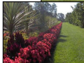
Figure 3: Ornamental beds at Agriculture and Agri-Food Canada in Ottawa, ON.