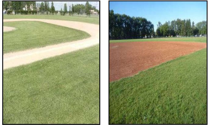
Figure 12: Ball diamonds and sports fields benefit from Alfalfa Green in the Town of Morden, MB. (left), and Innisfail, MB. (right)

Alfalfa Green can be used on new park areas to reduce compaction and improve soil conditions and the success of the sod or seed taking root. Here Alfalfa Green was used by the Town of Three Hills (AB) on their Anderson Park.