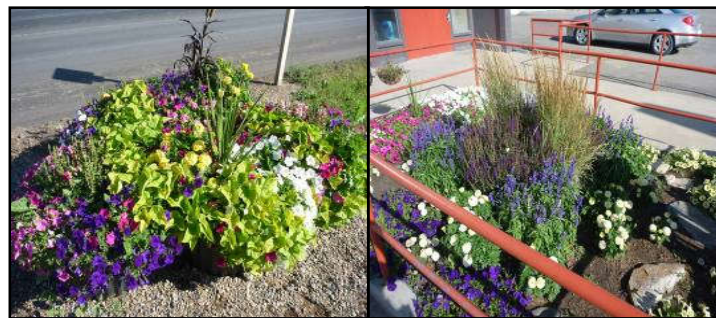
Figure 10: Alfalfa Green helps improve degraded soils and promote plant growth, such as in these flower beds along the highway in Rosetown, SK.

Western Alfalfa Milling Co. Ltd. (WAMCO) Box 568, Norquay, Saskatchewan, S0A 2V0 Phone: 306 594 2362 Email: info@alfalfagreen.ca Web: www.alfalfagreen.ca