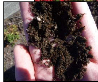
Figure 4: The soil is key to healthy plant growth and attractive flower beds, such as this one in Innisfail, AB.