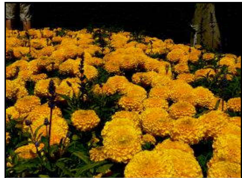
Figure 2: Marigolds growing at Butchart Gardens in Victoria, BC.