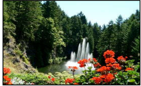
Figure 1: Butchart Gardens in Victoria, BC. showcases breath-taking horticultural displays.

The Town of Stony Plain, AB. uses Alfalfa Green on some of their flower bed areas. AG can delay senescence, improving the period of time when your flowers look alive and beautiful.