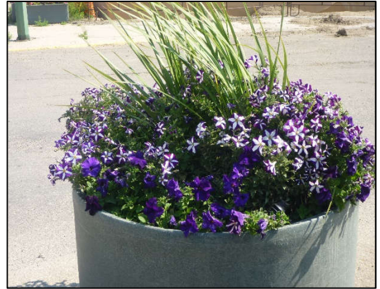
Figure 7: Flower pot in the Town of Shaunavon, SK.