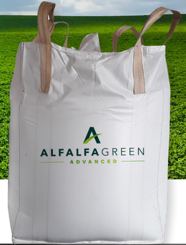
Alfalfa Green Advanced